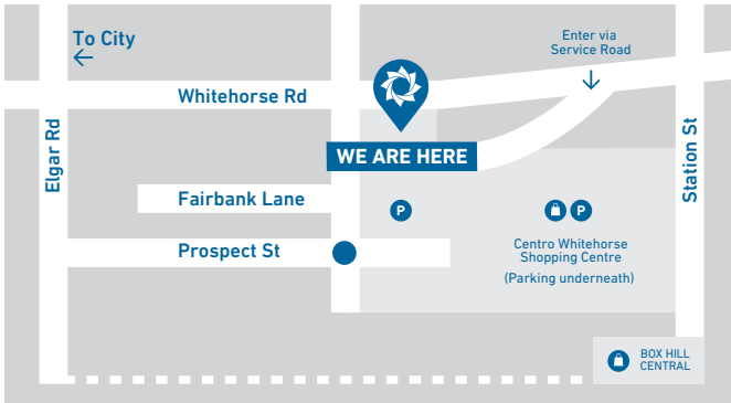
Vision Eye Institute Box Hill Level 1, 852 Whitehorse Road, Box Hill VIC 3128 1800 MACULA T: 03 9890 4333 F: 03 9890 4666