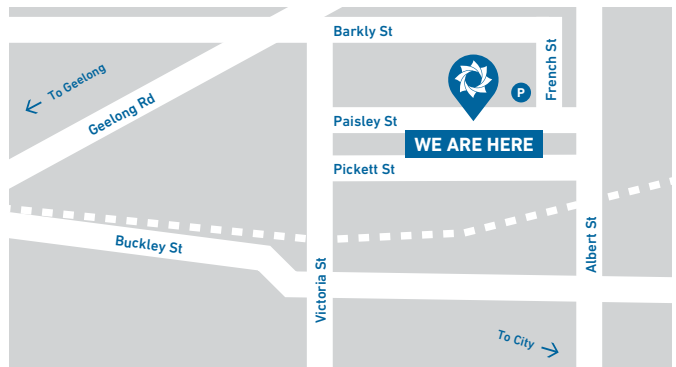
Vision Eye Institute Footscray 89 Paisley Street, Footscray VIC 3011 T: 03 9689 9233 F: 03 9689 9718