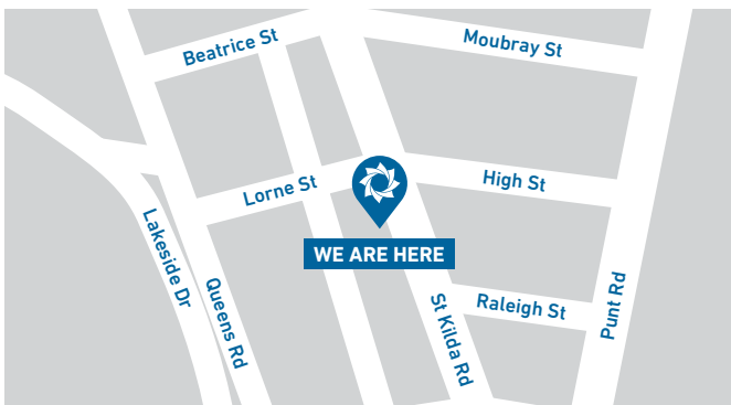
Vision Eye Institute Melbourne Ground floor, 600 St Kilda Road, Melbourne VIC 3004 T: 03 9521 2175 F: 03 9530 2445