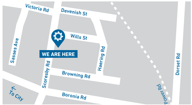
Vision Eye Institute Boronia Suite 5, 157 Scoresby Road, Boronia VIC 3155 1800 MACULA T: 03 9890 4333 F: 03 9890 4666